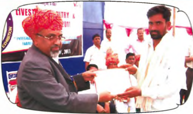
"Livestock, Poultry & Fish Fair" at KVAFSU, Bidar During 29-30 th Jan., 2011, Awarding Progressive Farmer