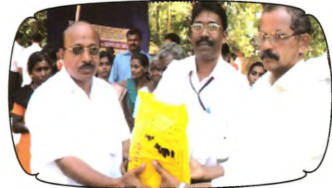
Animal Health Camp at Menala, Sullia (Tq) by EEC, Mangalore, on 6-01- 2011