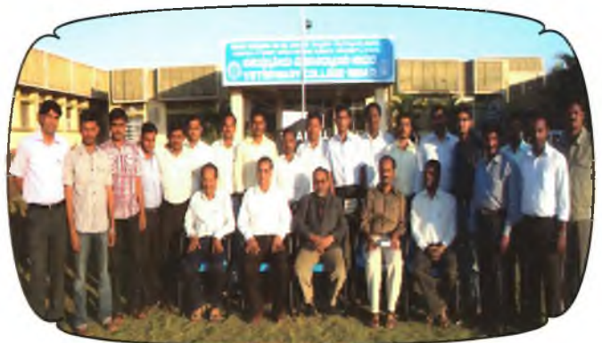
Training on Human Resource Management at Veterinary College, Bidar During 3-6 th Jan., 2011