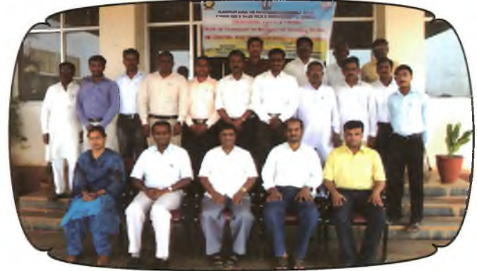
Training Programme on "Role of Livestock in Integrated Farming System" During 8 th -10 th March., 2011 at Veterinary College, Bidar