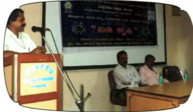
Training Programme on "Crab Farming" by EEC Mangalore on 11-01-2011