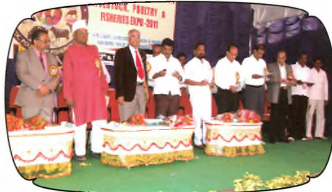
Jannuvaru, Kukkuta Matsya Mela, Held at Regional Campus Hebbal, Bengaluru, on 12-13 th Feb., 2011