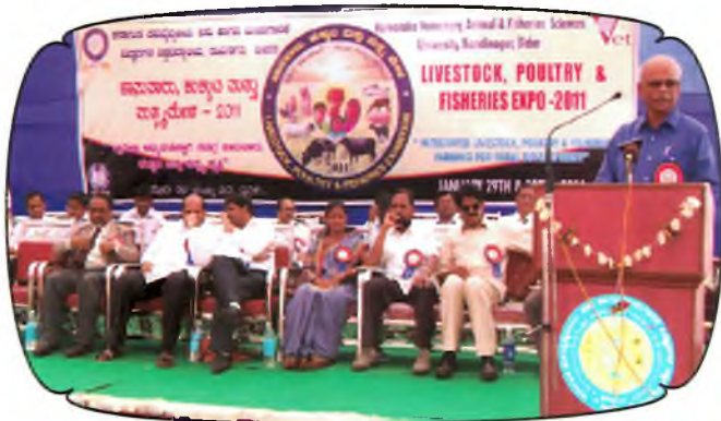
Livestock, Poultry, Fisheries Expo-2011 During 29-30 th , Jan., 2011