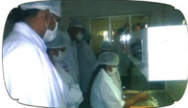
"Hands on Training on STD, Tuberculosis & John's Disease" from 18-22 nd Jan., 2011 in SRDDL, IAH&VB