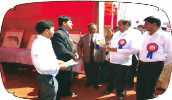
Pashu, Kukkuta and Matsya Mela, Bidar, 12-13 th Feb., 2011