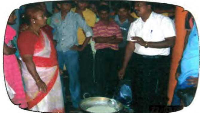
Training Programme Cum Demonstration on Value Addition of Milk' by Veterinary College, Shivamogga on 22-02-2011