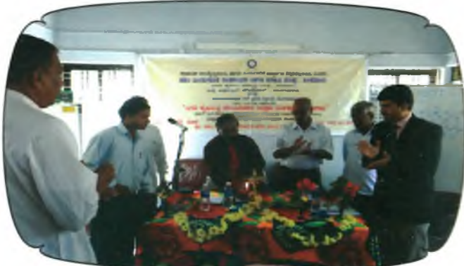
Workshop on "Better Management Practices in Shrimp Farming" on 22-01-2011 at MFRIC, Ankola