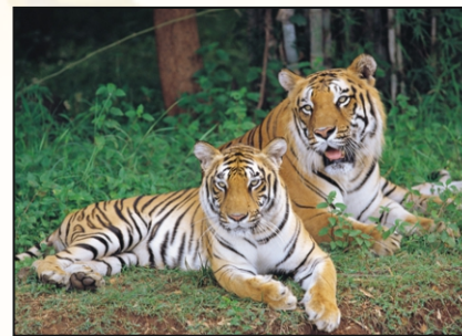
Bannerghatta National Park