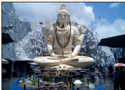
Shivoham Shiva Temple