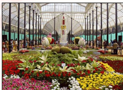
Lalbagh Botanical Gardens